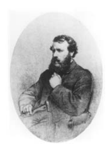
Alexander Smith, in Victorian Poetry Before 1850 (Detroit: Gale, 1984)