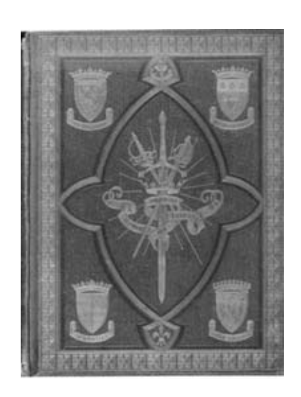
Aytoun, Lays of the Scottish Cavaliers (Edinburgh, 1863)