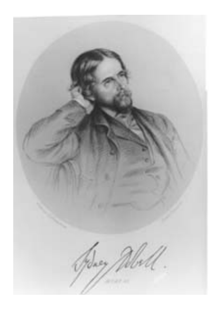
Sydney Dobell in Life and Letters of Sydney Dobell (London, 1878)