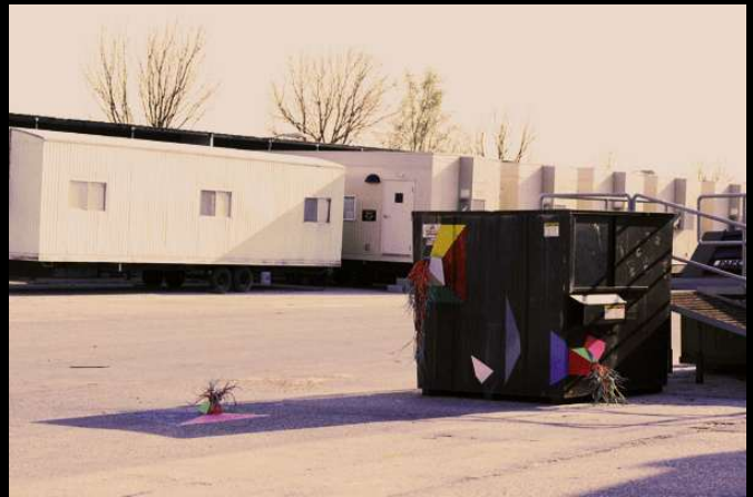
"Untitled" _Extension Cords