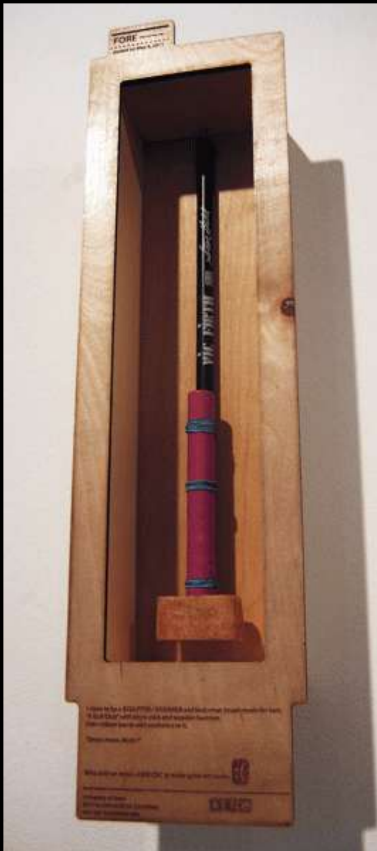
"Fore" Laser CNC