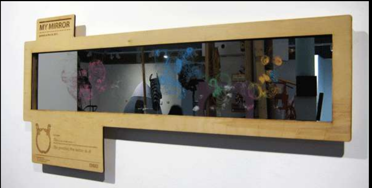
"My Mirror" _Laser CNC