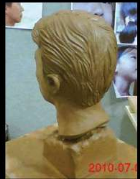
male asian adult