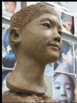
6 yr old asian girl