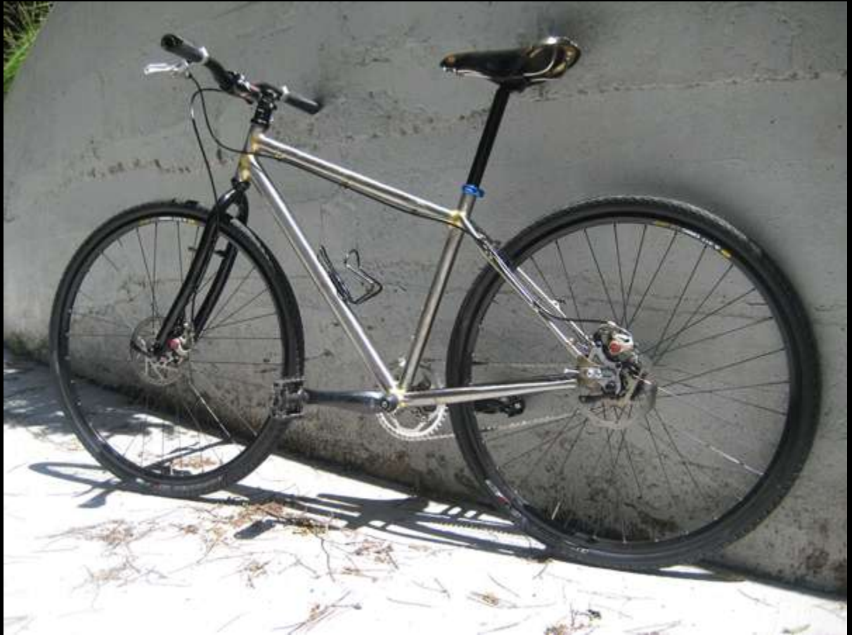
"Nude Bike" _Fillet Brazing/Tig Welding