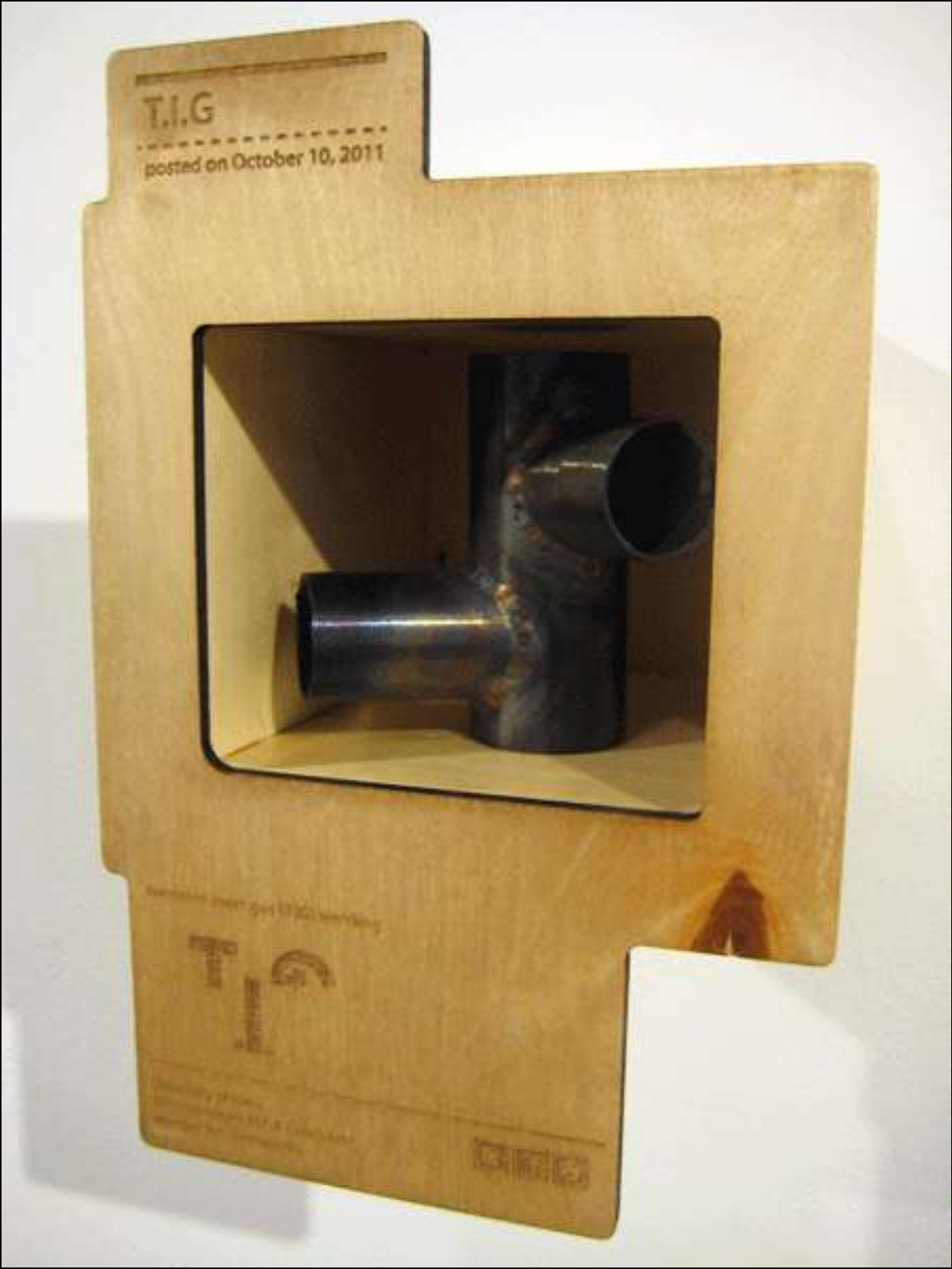
"T.I.G" _Laser CNC