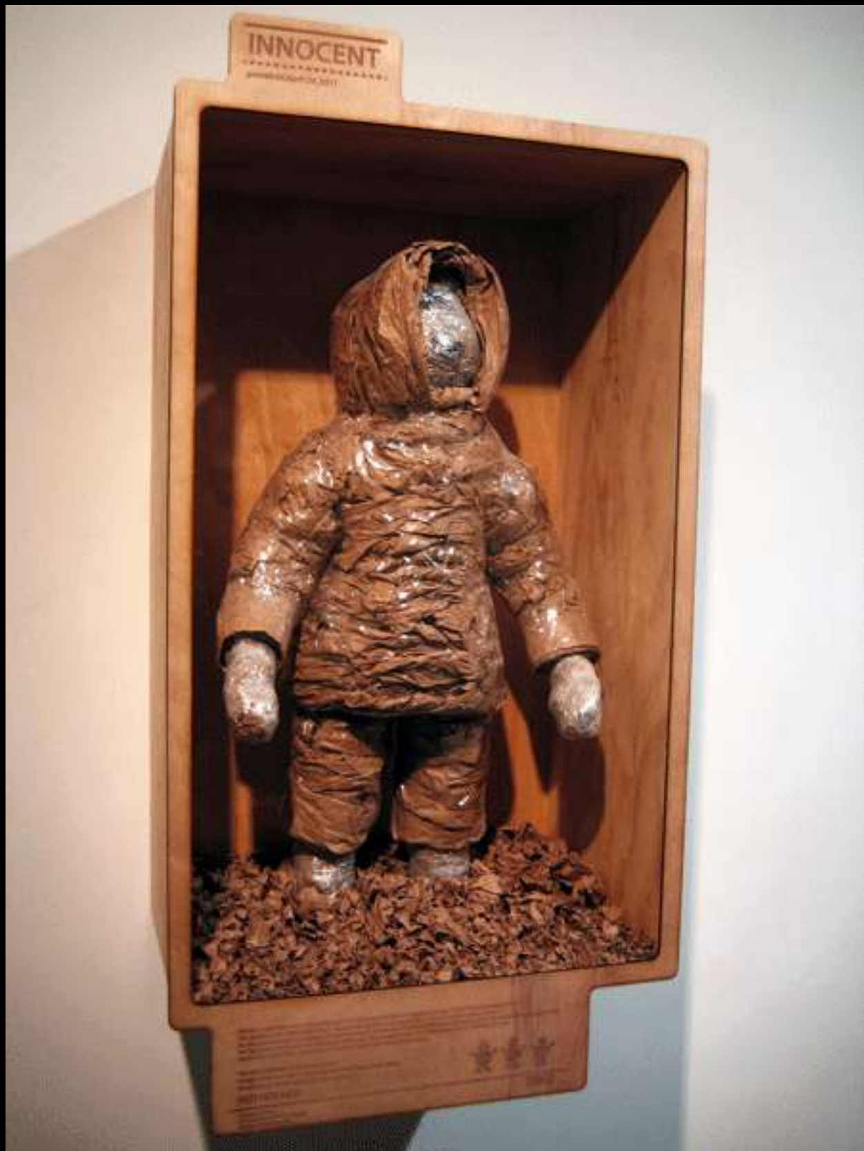
"Innocent" _Laser CNC/Brown Paper/Packaging Tape