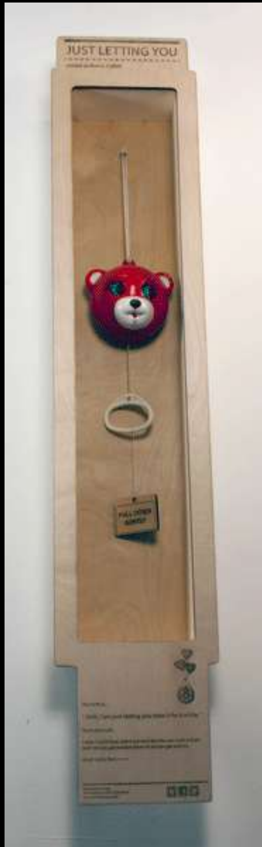
"Just Letting You" _Laser CNC