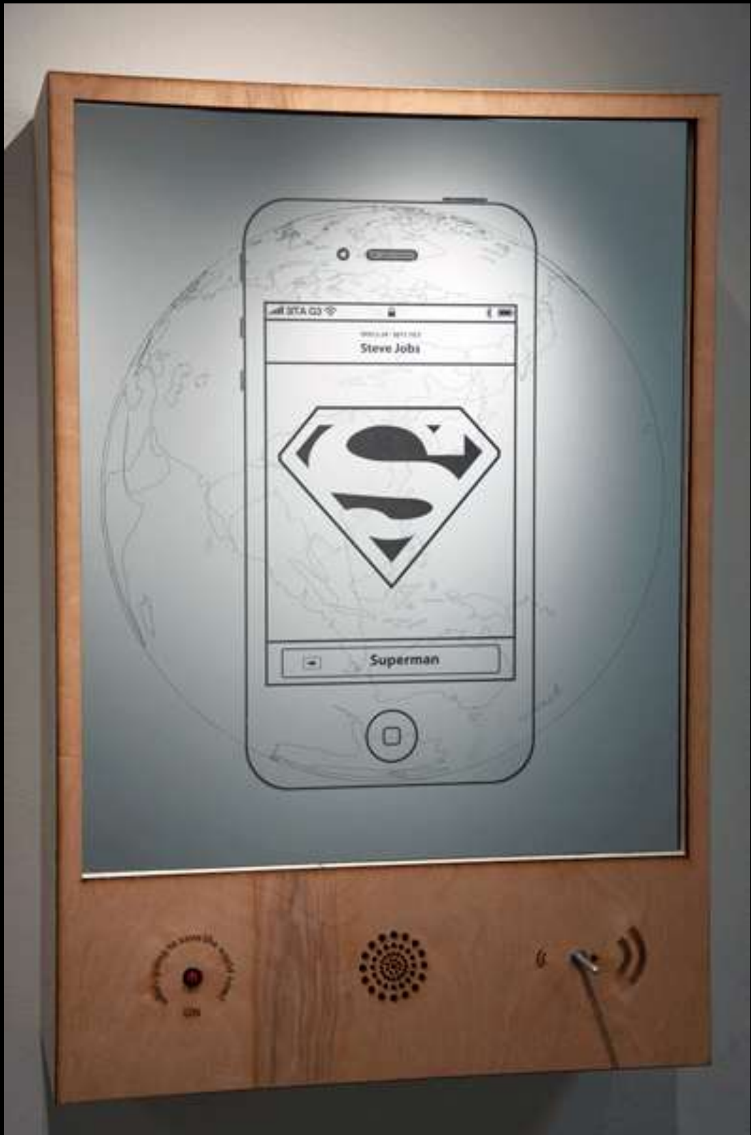
"S.J Superman" _Arduino Uno/Laser CNC